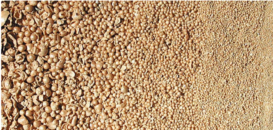
◁ ZIRCONIUM DIOXIDE (FUSED) SIEVE SEPARATION