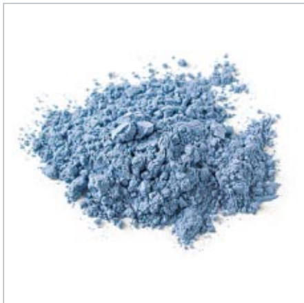
◁ ZIRCONIUM VANADIUM BLUE (Zr, V)SiO 4 – FINES REMOVAL