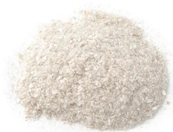
Ceramics - Glazes/Frits (SiO 2 ), D 50 = 100µm